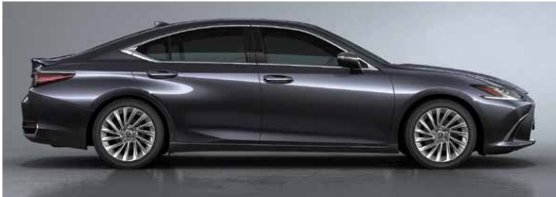
Sonic Chrome <1L1>