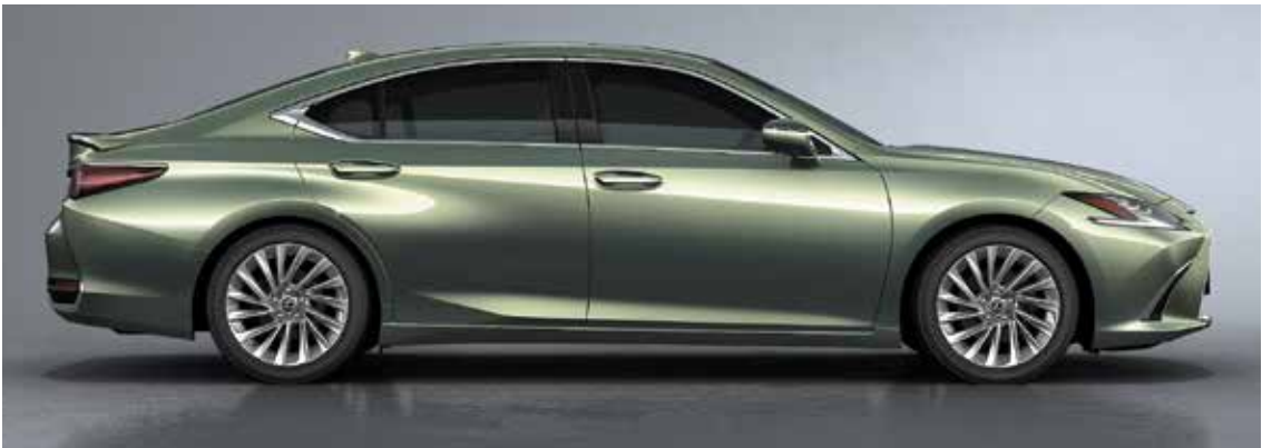
Sunlight Green <6X0>