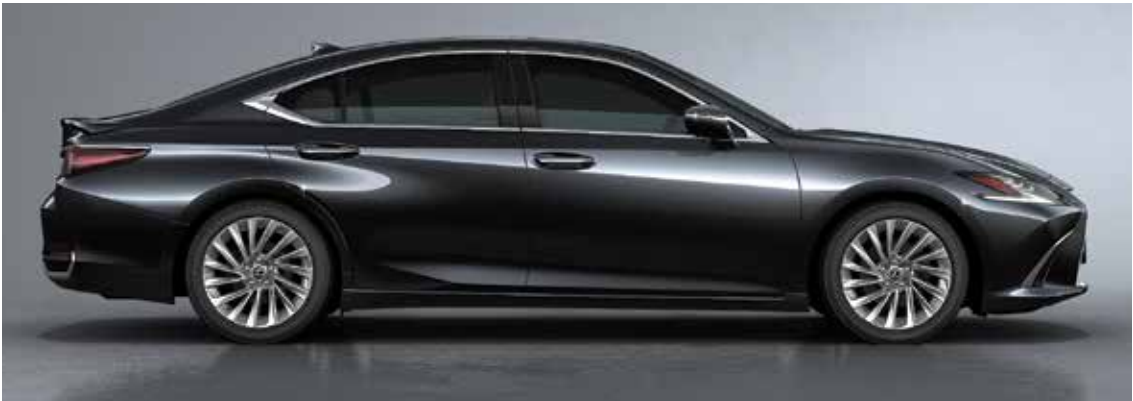
Graphite Black Glass Flake <223>