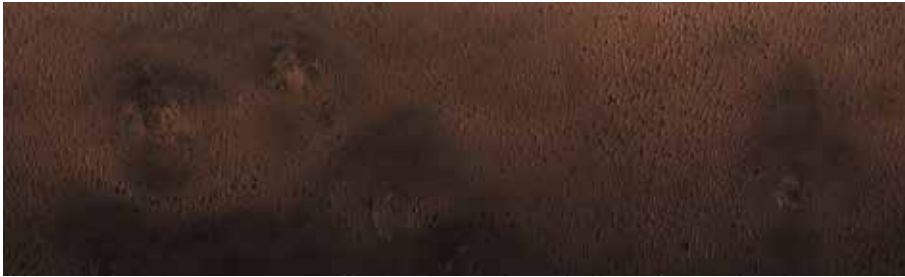
Walnut (Open Finish/Brown)