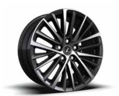
45.72 cm (18-inch) Aluminum wheels