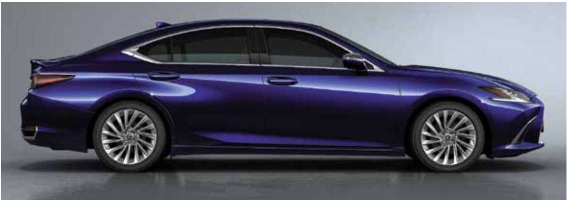
Deep Blue Mica <8X5>