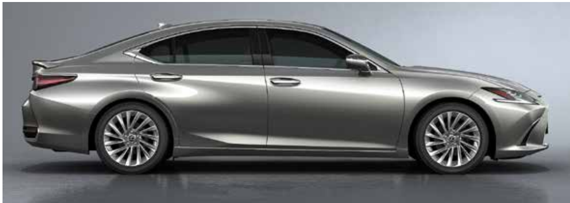
Sonic Titanium <1J7>