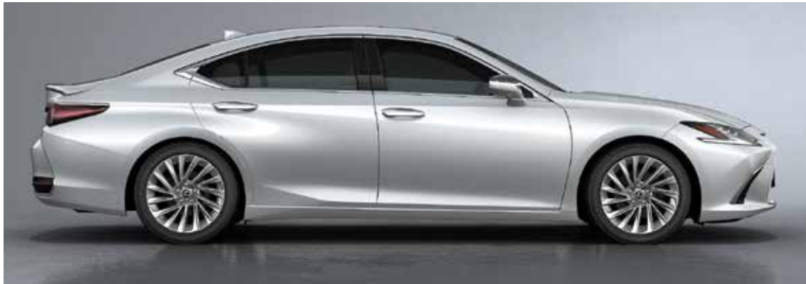
Sonic Quartz <085>

The ES is available in a selection of captivating and stimulating exterior and interior colors. Its rich form shows a changing face to the world in different light conditions such as sunlight and streetlights at night, providing a dramatic view that changes with the location and time of day.